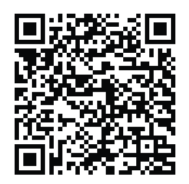
Scan this QR code to complete the survey